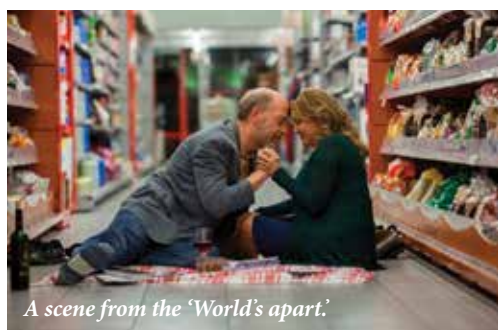
A scene from the 'World's apart.'