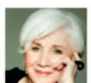
Guest Host Olympia Dukakis