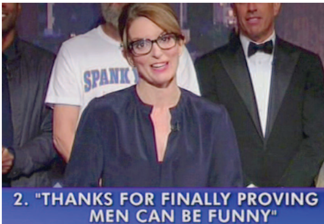
Tina Fey drew the prominent #2 slot on David Letterman's final star-studded Top Ten List. Behind her L-R are: Chris Rock, Jim Carrey, and Jerry Seinfeld.

2. Tina Fey: "Thanks for finally proving men can be